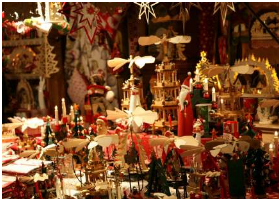
office de tourisme de Colmar